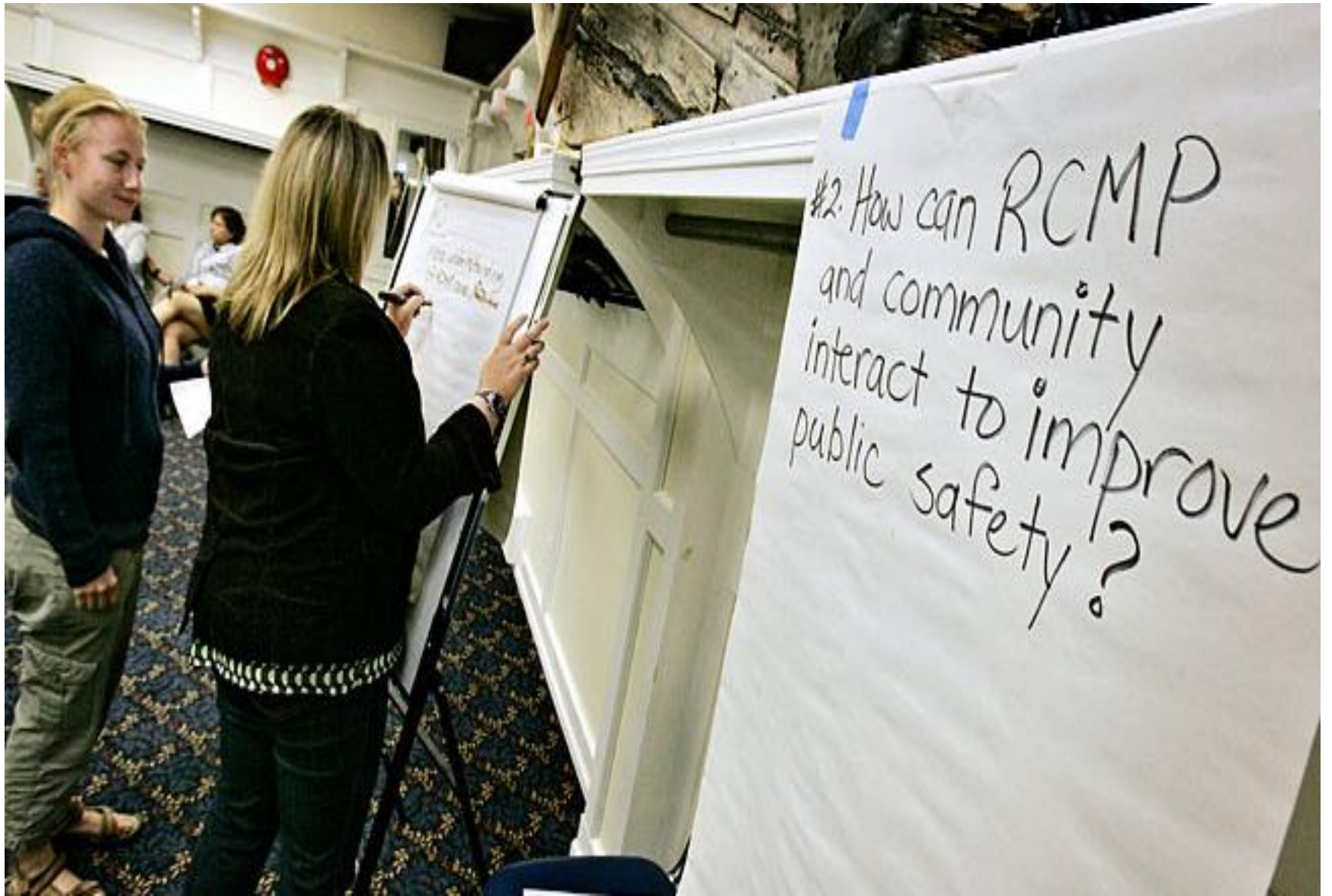
Voices and Experience of Women in the Community